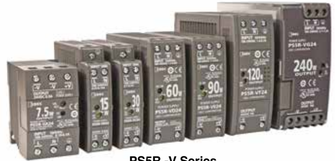
PS5R -V Series